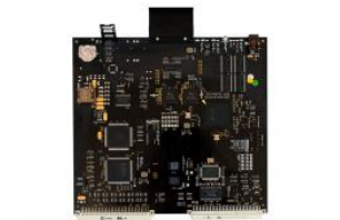
AMC-IP Version 11

Processor Board for AlphaCom XE and ESC1