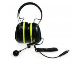
AK5850HS Ex-approved Headset