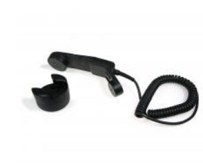
TAX-3 EX Handset