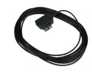
TAX-2B Ex-Approved Plugbox & Cable for Headset with PTT