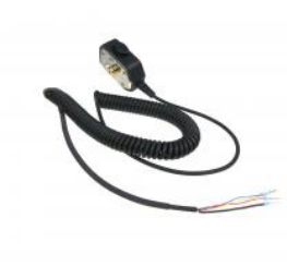
EMMAX-1H Handheld Industrial EX Microphone For Exigo/Turbine