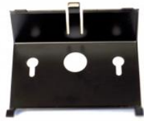
Wall Bracket for Desktop