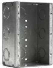
3 Gang Flush Mount back box