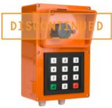
Industrial Master Station