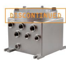
MBX2MAA Communication box

EXPLOSION-PROOF COMMUNICATION BOX IN STAINLESS STEEL