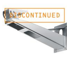
NXWBS1 Wall Bracket

EXPLOSION-PROOF COMMUNICATION BOX IN STAINLESS STEEL