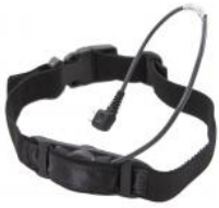
AK6070T Throat microphone for all A-kabel type Headsets