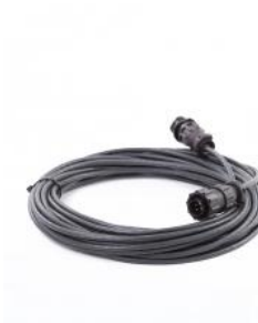
Extension Cable for headset and hand microphone, 10 m