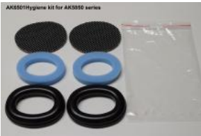
Hygiene kit for Headset Hygiene kit for Headset