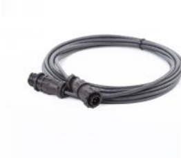
Extension Cable for headset and hand microphone, 5 m