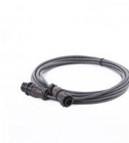
Extension Cable for headset and hand microphone, 5 m