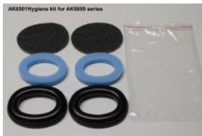
Hygiene kit for Headset