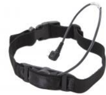
AK6070T Throat microphone for all A-kabel type Headsets

Headset stowage Bracket for Wall mounting