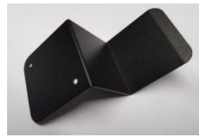
Headset Stowage Bracket

Spare Boom Microphone for all A-Kabel type Headsets