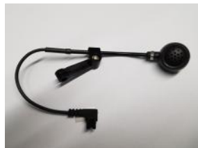
Spare Boom Microphone for Headset

Spare Boom Microphone for all A-Kabel type Headsets