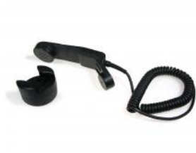
TAX-3 EX Handset