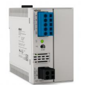
Power Supply 100-240VAC/48VDC 2A