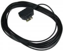
TAX-2B Ex-Approved Plugbox & Cable for Headset with PTT