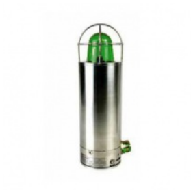
TNFCD2G212 Ex proof beacon, Ex de 24-48VDC GREEN, 1 x M25 gland