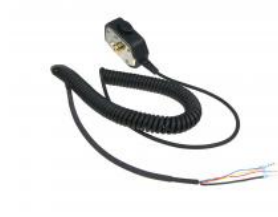
EMMAX-1H Handheld Industrial EX Microphone For Exigo/Turbine