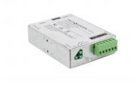
FCDC3 Flowire Ethernet Converter - DC Voltage