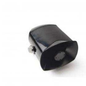
DSP-15 EExmN, 25W Ex horn speaker for TFIX-V2 stations, 8 Ohm