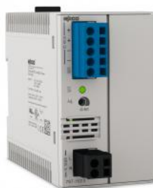
Power Supply 100-240VAC/48VDC 2A