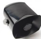
DSP-15 EExmN, 25W

Ex horn speaker for TFIX-V2 stations, 8 Ohm