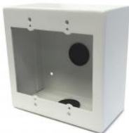
TA-13 Turbine Mini On-Wall Back Box White