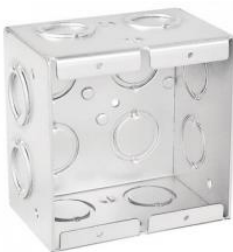
TA-3 2½" Deep Flushmount Backbox for Turbine Compact & Mini