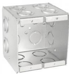
TA-2 US 2-Gang 3½" Deep Backbox