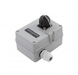
CD-4 Plugbox Waterproof