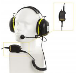
VSP-36-PELP-A/20 Headset with boom mic, headband, and 20m cable