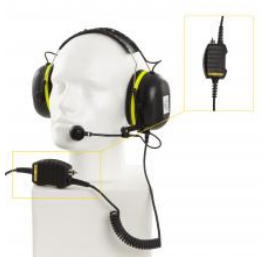
VSP-36-PEL-A Headset with boom mic, headband, and 10m cable