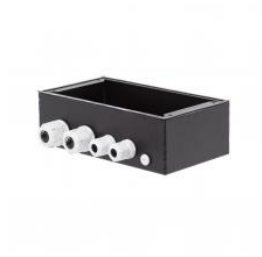
MBOKS-G VSP Batteryless Telephone System