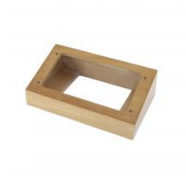
VSPC-OAK Wooden OAK Cabinet