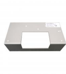
VM-0411 Protection cover for VSP-stations