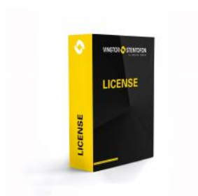
IP-ARIO Audio License