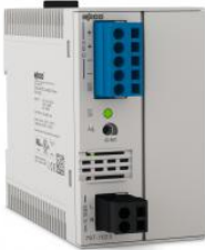
Power Supply 100-240VAC/48VDC 2A