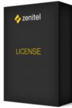
ILS-IC, IP Station License