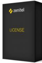
ILS-SIP, SIP Station License