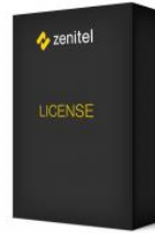
ILS-SC, IP-Station License, Softclient