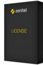
ILI-AN2 / ILI-AN8, AlphaNet License (2 Lines and 8 Lines)