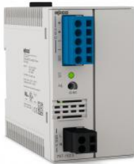
Power Supply 100-240VAC/48VDC 2A